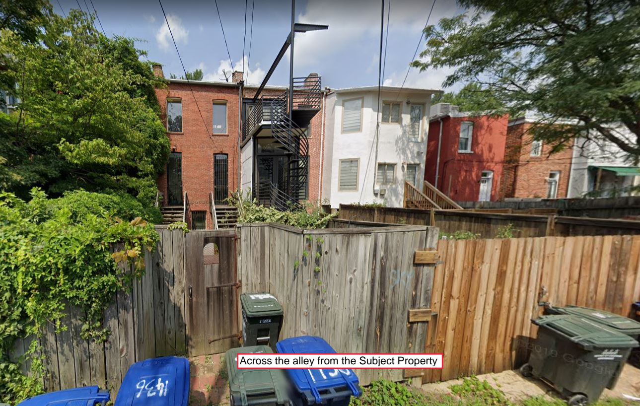
Across the alley from the Subject Property