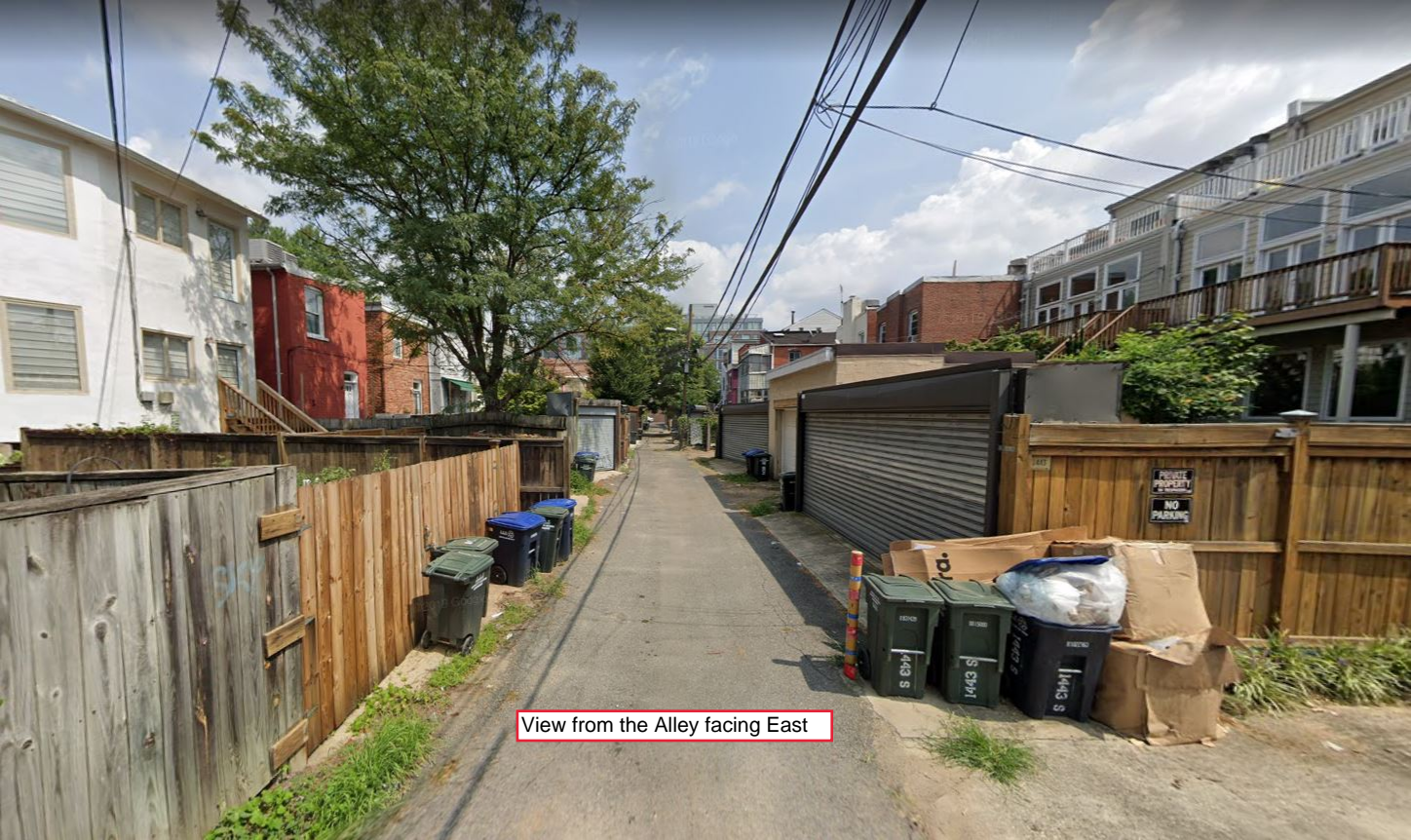
View from the Alley facing East