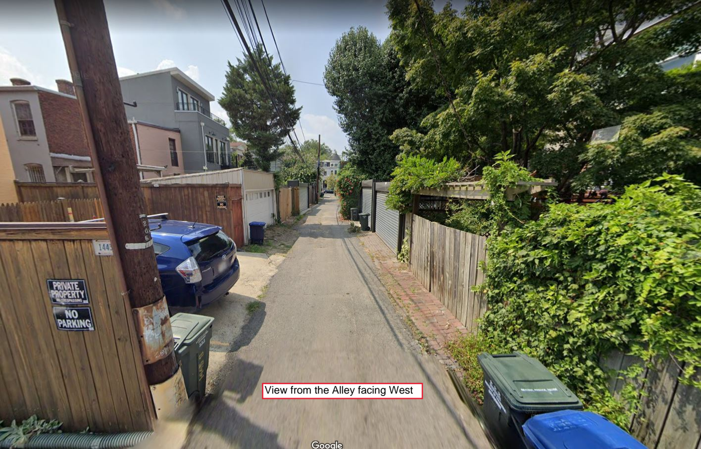
View from the Alley facing West